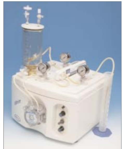
Photo of Minimate TFF Capsule on a Minim™ pump station with 0-4 bar (0-60 psi) pressure gauges