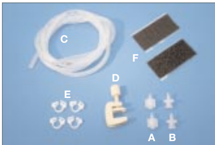
Minimate Fitting Kit