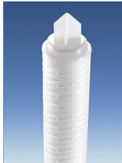
Figure 3: Emflon PFAW cartridges offer exceptionally high flow rates and are used for less critical bioburden reduction in gases.