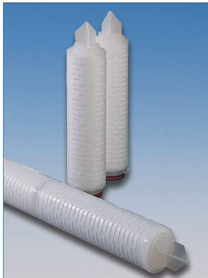
Figure 2: Emflon PFW cartridges are designed for sterilization of large volume gases in compact installations.