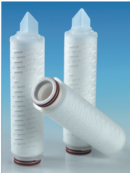
Figure 1: Emflon HTPFRW cartridges provide sterilization of high temperature gases and can be considered for use in oxygen-enriched air applications.

Pall's Emflon filter family offers a variety of solutions for addressing microbial removal in air and gas applications. Please contact Pall for further information.